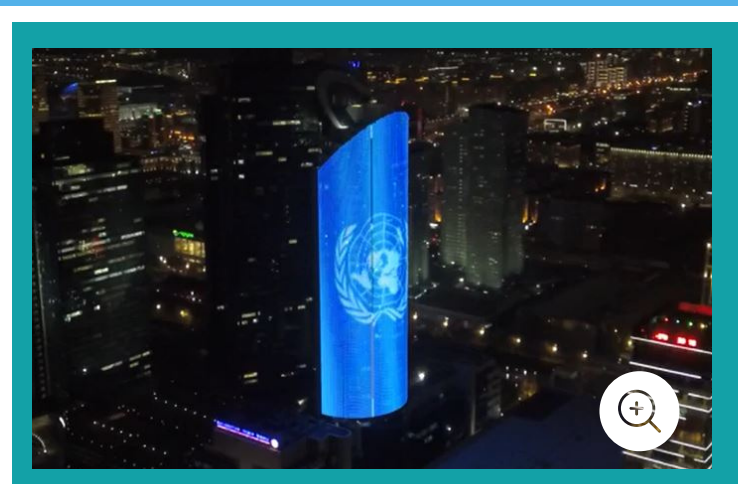
Landmark building in Nur-Sultan - Kazakhstan Temir Zholy Tower lit up UN blue in support of the UN75 and UN Day campaign during the lockdown measures