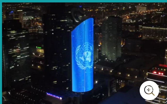
Landmark building in Nur-Sultan - Kazakhstan Temir Zholy Tower lit up UN blue in support of the UN75 and UN Day campaign during the lockdown measures